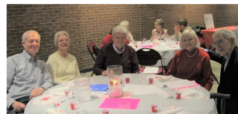
Valentine Senior Social February 2020