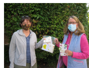
Girl Scout Troop 6084, Fifth Grade, Wolftrap Elementary School delivered hand-made Thanksgiving greeting cards and SC volunteers delivered lunch to clients