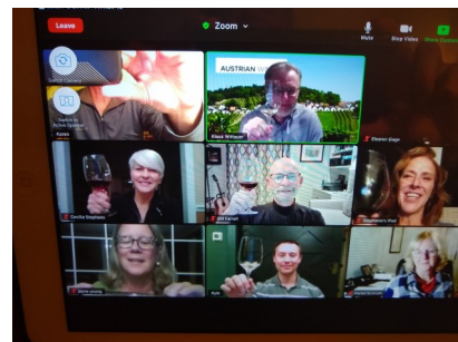
Wine Tasting November 2020