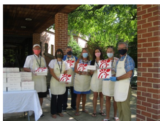
Volunteer Appreciation 2020 Lunch (Chick-Fil-A) & Zoom celebration