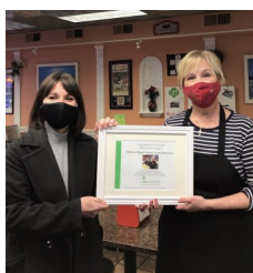
Showing our appreciation to Skorpis Restaurant for supporting our Holiday meal drive.